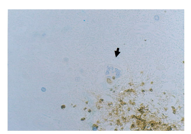
Figure 3 Immunochemical positivity of toxoplasmic tachizoites phagocyted by an HIV-related multinucleated giant cells at the periphery of a microglial nodule (arrow). A high number of protozoas in the lesion are stained by IHC. Immunoperoxidase, Haematoxylin counterstain, \times 400 .